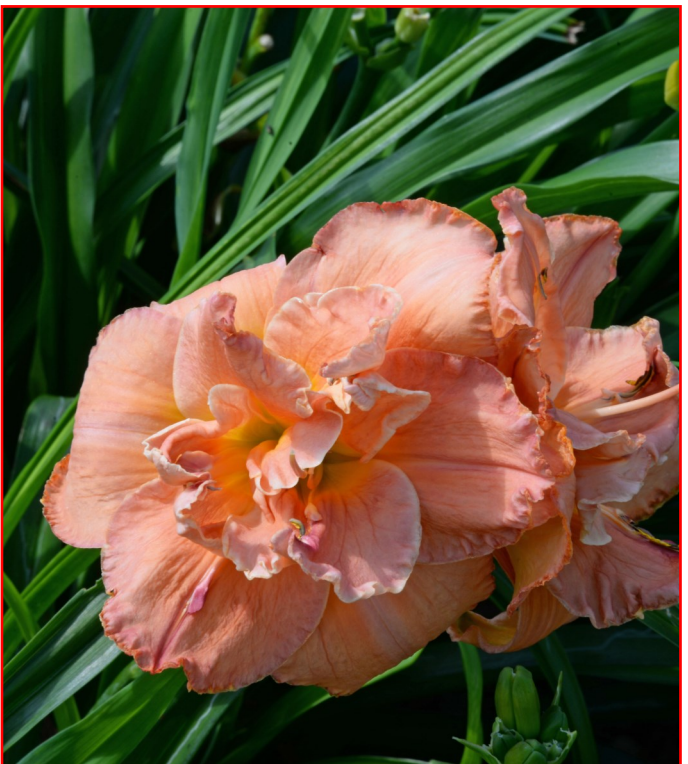
Georgia Gold Digger, Firefly Daylily Garden