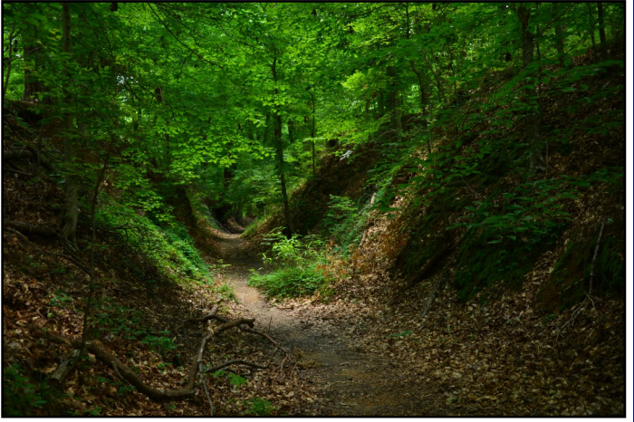
Sunken Trace, Natchez Trace, Natchez, MS