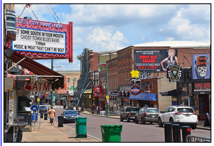
Beale Street, Memphis, TN