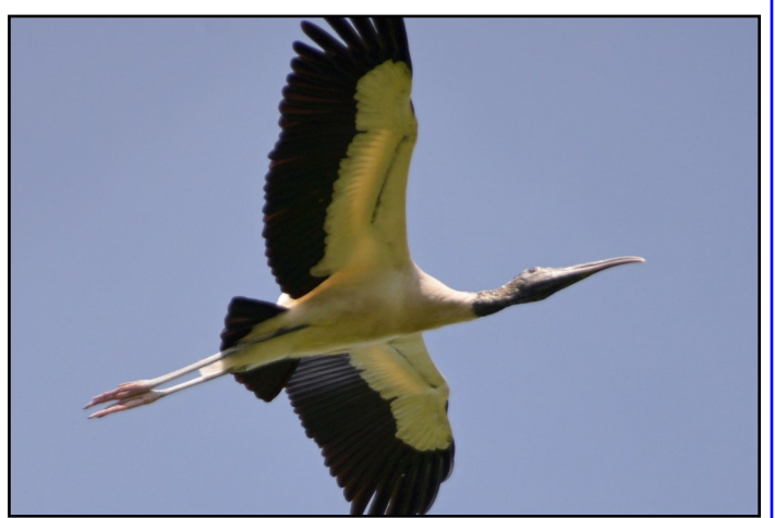
Wood Stork in Flight, Harris Neck National Wildlife Refuge