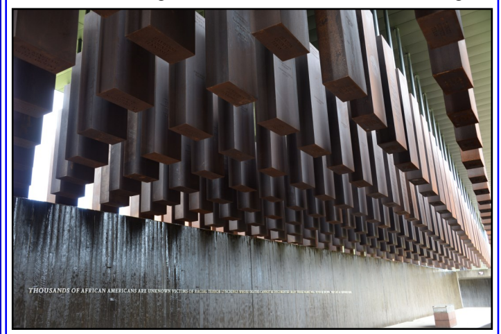
National Memorial for Peace & Justice, Montgomery, AL