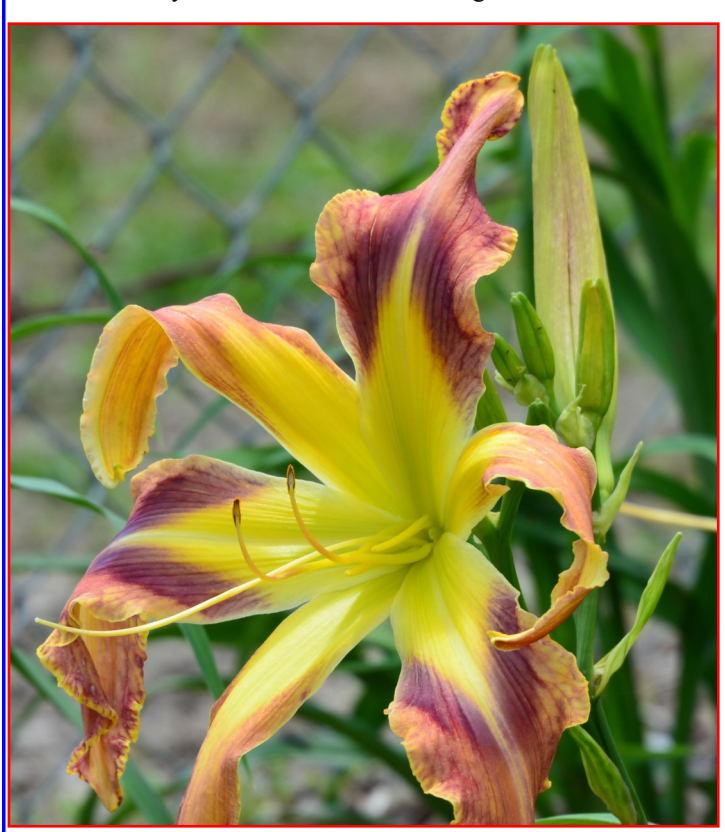
Buddy's Miss T, Penny's Daylily Patch