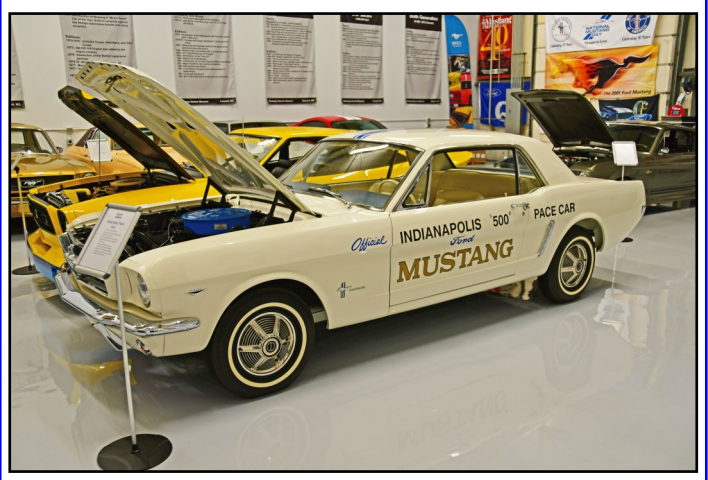
Mustang Owner's Museum, Concord, NC