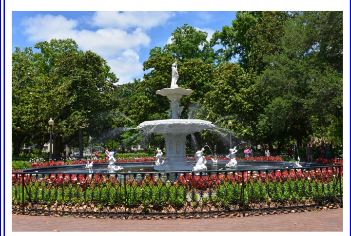
Forsyth Park, Savannah, GA