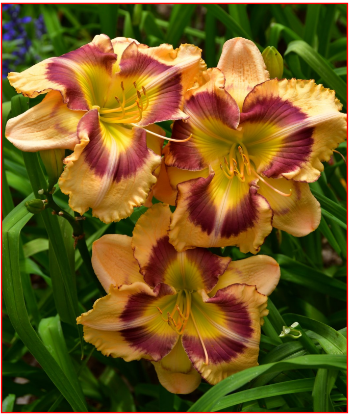
God Bless Louisiana, Rolling Oaks Daylilies