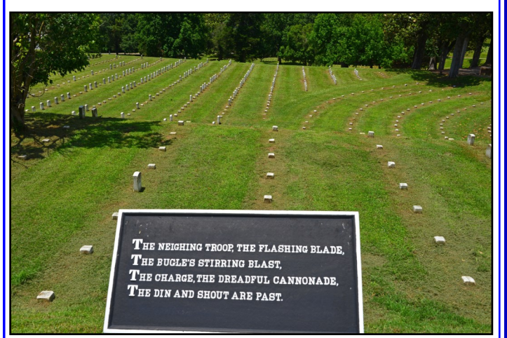
National Cemetery, Vicksburg, MS