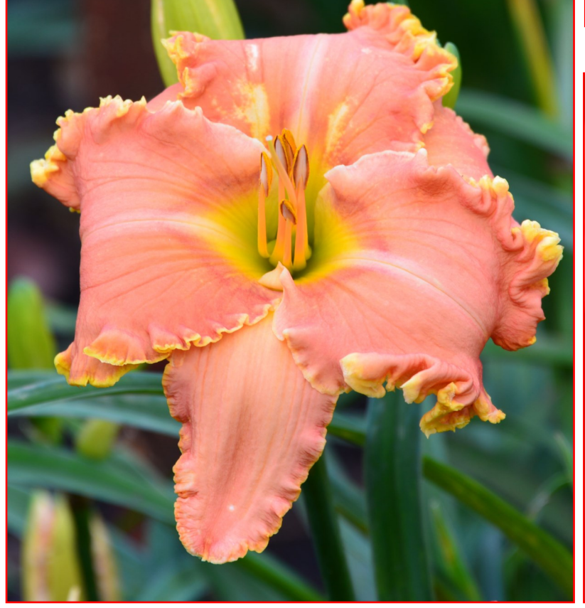
Mango Margarita, Suburban Daylilies