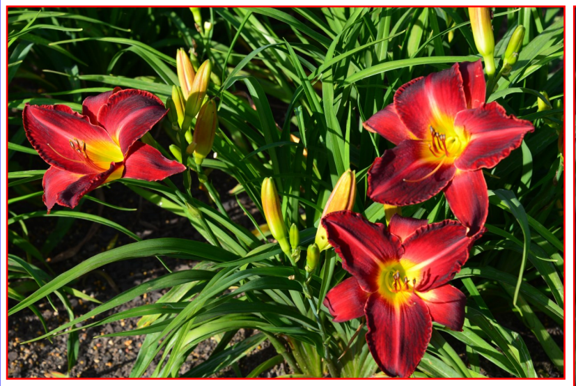
Suburban Nancy Gayle, Suburban Daylilies