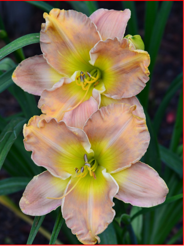
Butterscotch Brittle, Suburban Daylilies