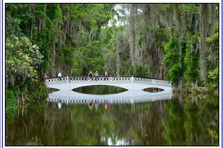
Magnolia Plantation, Charleston, SC

Iowa, Illinois, Indiana, Kentucky, North Carolina, South Carolina, Georgia, Alabama, Mississippi, Louisiana, Tennessee (2x), Arkansas, Missouri