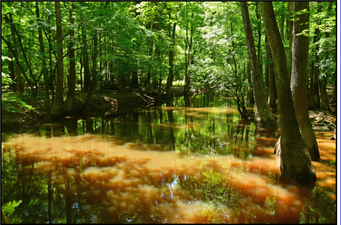
Cedar Creek, Congaree National Park, SC (Along with 3 Poisonous Snakes)